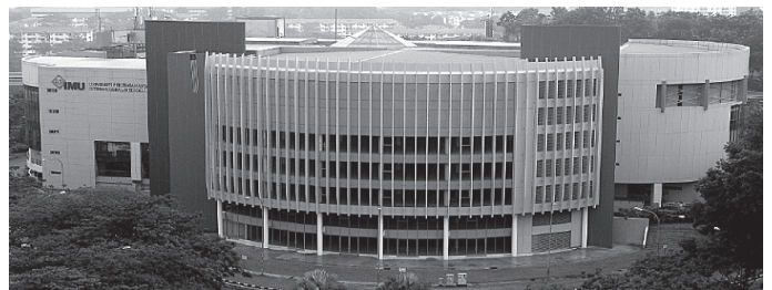
IMU Campus in Malaysia